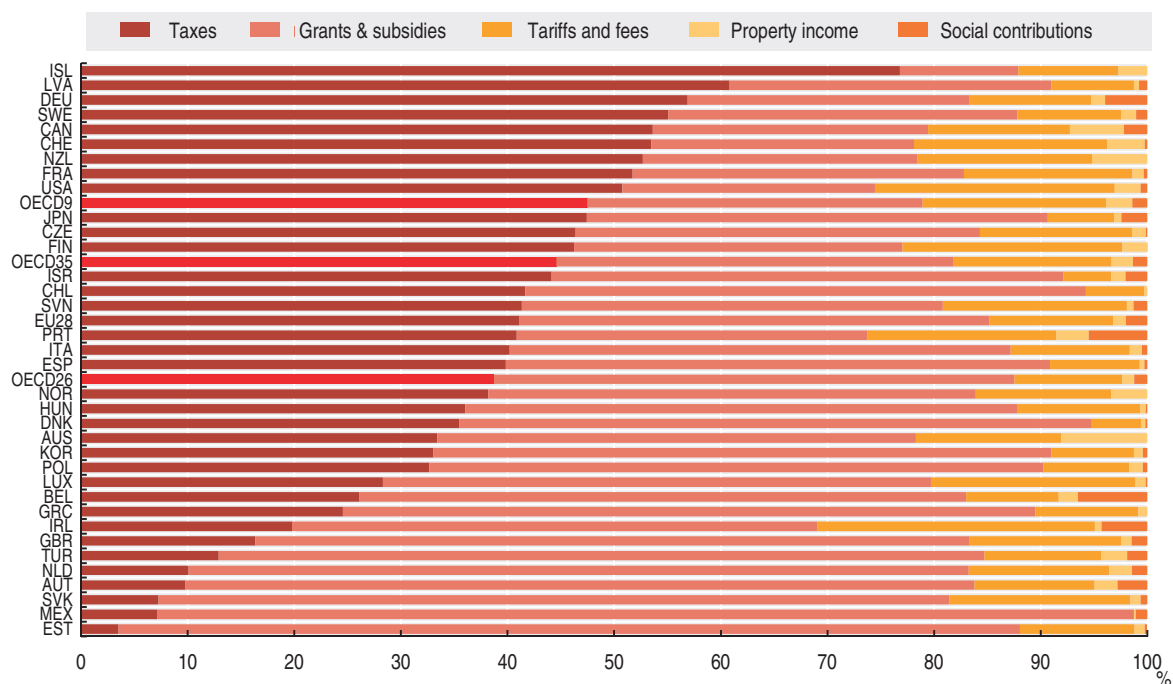
5.20. Structure of subnational government revenue, 2016 (%)

StatLink http://dx.doi.org/10.1787/888933818663