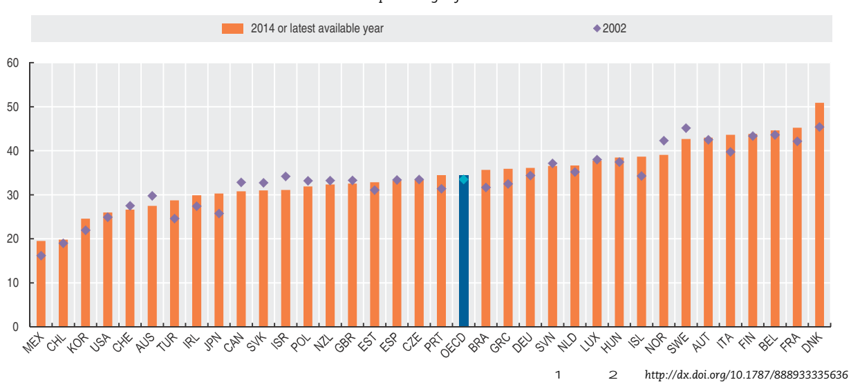
Total tax revenue