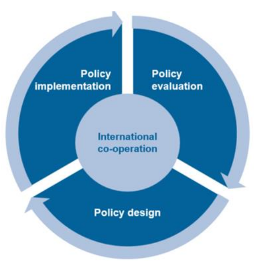
Figure 3. The emerging tech policy cycle