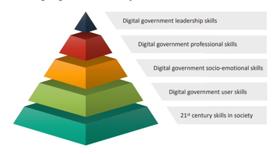
Figure 1.2. Skills for digital government maturity

As part of this forward looking and proactive approach, governments need to build effective strategies to foster talent and skills for digital government. Previous work by the OECD has shown that digital government requires a broad set of skills, expressed through the work of diverse and multi-disciplinary teams (OECD, 2021[9]). The adoption of digital technologies in the public sector means that all civil servants should have a basic level of 21st century skills that enables them to be confident in using key digital tools and digital technologies. Digital government efforts build on this foundation in four areas: digital government user skills, digital government socio-emotional skills, digital government professional skills and digital government leadership skills (Figure 1.2).