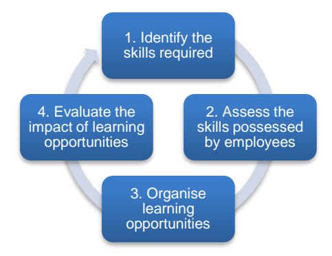
Figure 1.3. Approach to foster skills for digital government

Existing research shows that the way learning opportunities are designed, delivered, and implemented determines the impact it will have on employees, organisations, and economies as a whole (OECD, 2021[14]). Approaches to strengthen skills for digital government are no exception (Figure 1.3). In a first step, governments need to identify the digital and complementary skills required and assess the extent to which their employees already master them. This makes it possible to detect gaps and organise training and learning opportunities to address them, maximising the use of available resources. Governments then need to evaluate the impact of learning opportunities, to draw lessons for future initiatives.