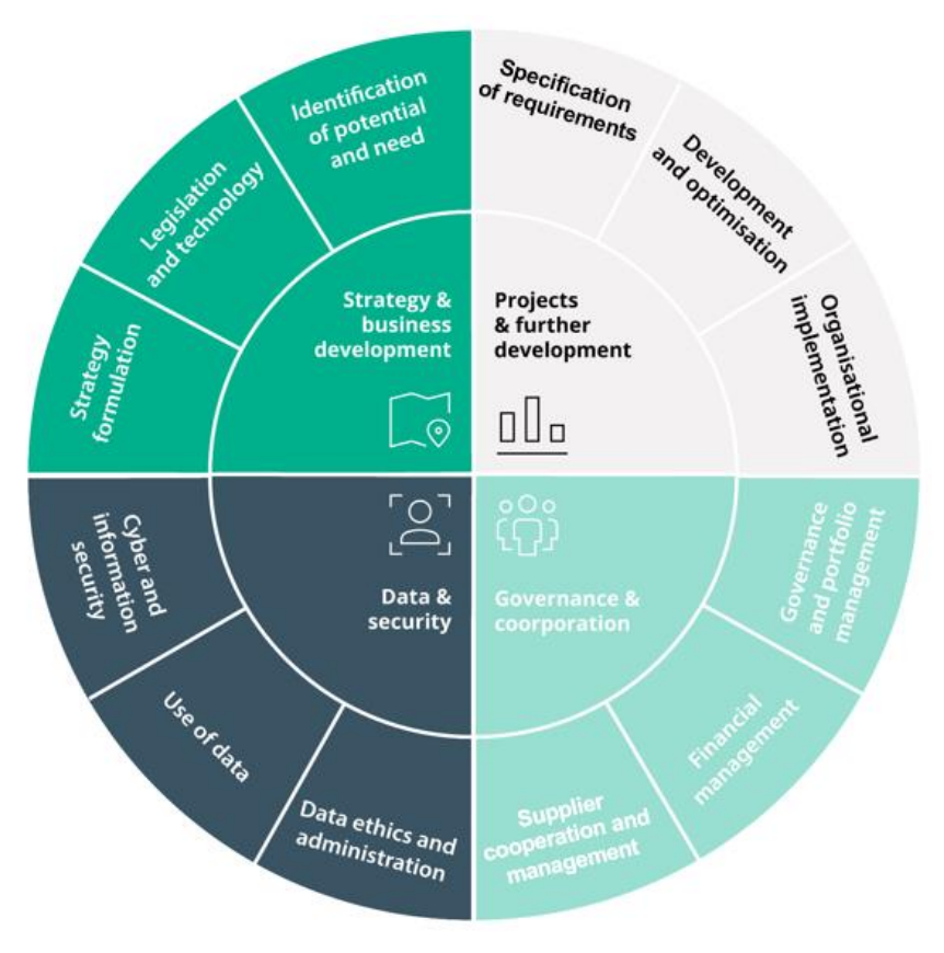
Figure 2.1. Danish Model of Digital Skills