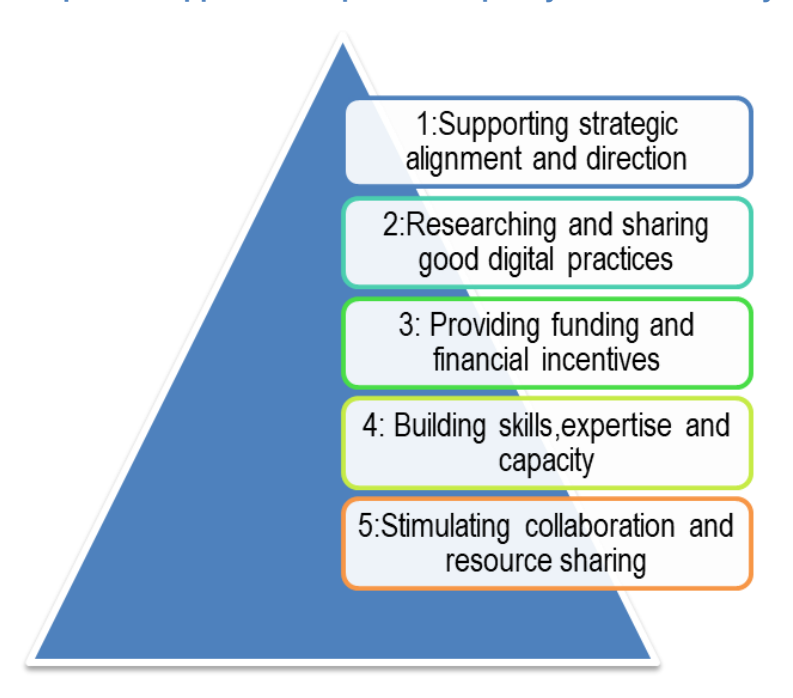
Figure 4.2. Options for public supports to improve the quality of online and hybrid education

Advice for strategic alignment and institution self-evaluation of its digital higher education provision is becoming widespread across OECD countries. In New Zealand, Ako Aotearoa first established strategic advice for institutions on e-learning in 2014 (Coolbear, 2014<sub>[37]</sub>). Norway's Standing Quality Committee of Flexible Education Norway (FuN) also has long-established guidelines to support institutions with the development of strategy for digital higher education quality (Flexible Education Norway, 2018<sub>[38]</sub>).