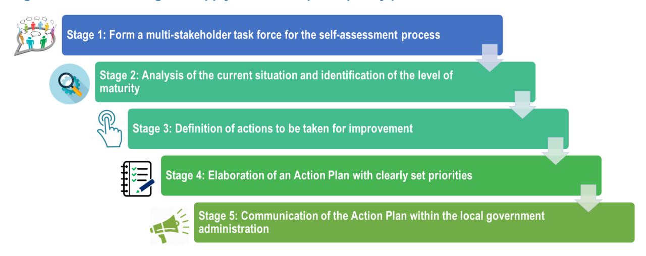
Figure 2.1. The five stages to apply the SAT: A participatory process

To apply the SAT, each LSGU should ensure participation and engagement from all relevant actors. The self-assessment result itself is as important as the process conducted by the LSGU to reach the final self-assessment in order to build ownership of its results across the LSGU administrative structure. Such an approach also allows for more effective and smoother implementation of the subsequent action plan (Stage 4) that is developed in consequence of the self-assessment process. The self-assessment is thus an exercise that requires broad participation at all stages of implementation and serves, at the same time, as a capacity building and dialogue process.