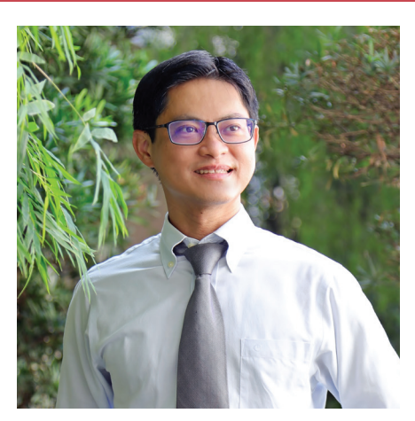
The video footage of this insight can be seen from: <u>https://bit.ly/GTL_Benny</u>