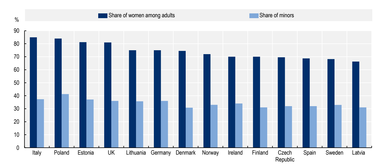
Figure 1. Share of minors and women among registered refugees in selected countries

employment. By contrast, if elderly relatives are in good health and able to support with childcare functions, their presence might boost the labour market participation of single mothers (OECD, 2022<sub>[2]</sub>).