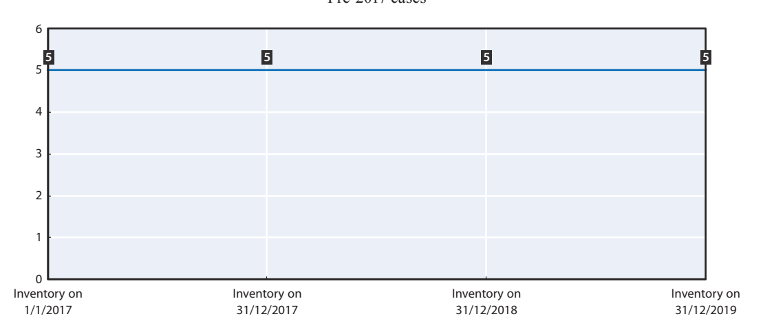
Figure C.2. Evolution of Thailand's MAP inventory Pre-2017 cases

Figure C.2 shows the evolution of Thailand's pre-2017 MAP cases over the Statistics Reporting Period.