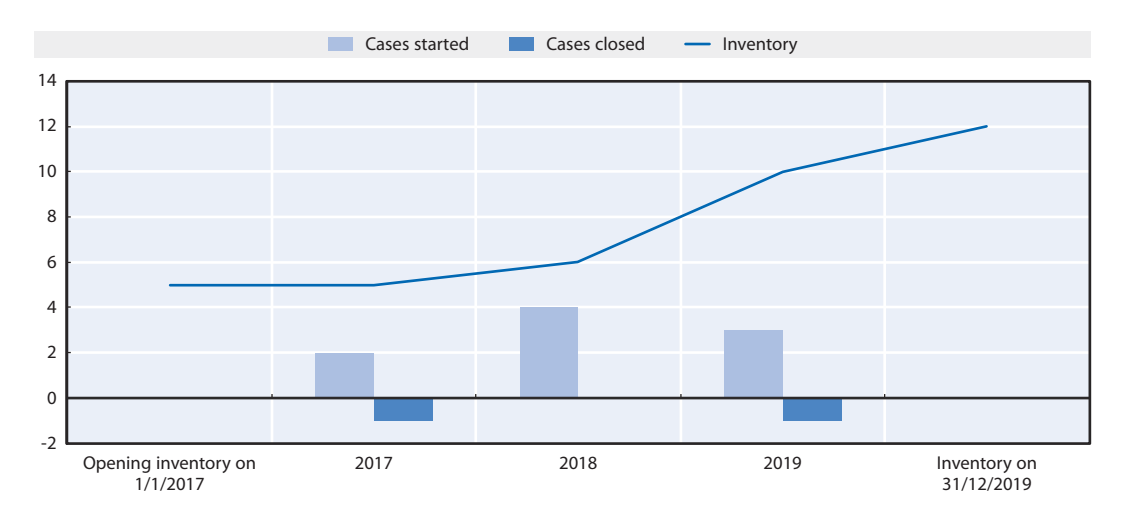
Figure C.1. Evolution of Thailand's MAP caseload

95. At the beginning of the Statistics Reporting Period Thailand had five pending MAP cases, all of which were other MAP cases.<sup>2</sup> At the end of the Statistics Reporting Period, Thailand had 12 MAP cases in its inventory, all of which are other MAP cases. Thailand's MAP caseload has increased by 140% during the Statistics Reporting Period.