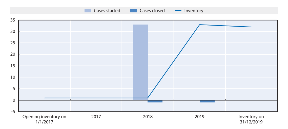
Figure C.1. Evolution of Qatar's MAP caseload