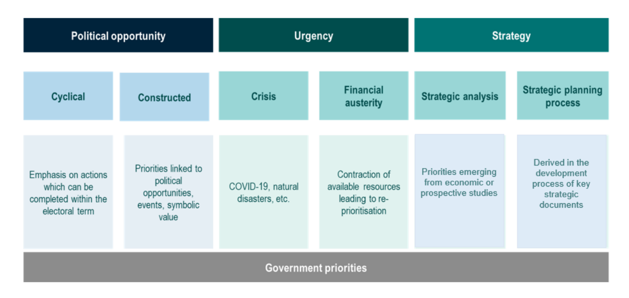
Figure 2.2. Sources of prioritisation

Source: Author's own elaboration adapted from (Institute for Global Change, 2016[26]).