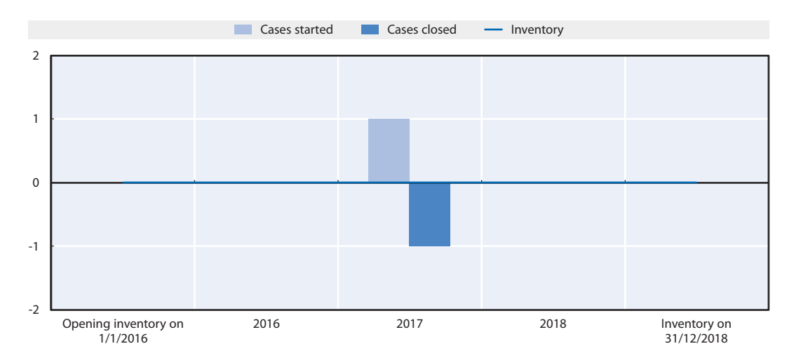
Figure C.1. Evolution of Guernsey's MAP caseload

108. Throughout the Statistics Reporting Period Guernsey had only one MAP case in 2017, which was closed within the same year. Therefore, there is no MAP case in Guernsey's end inventory.