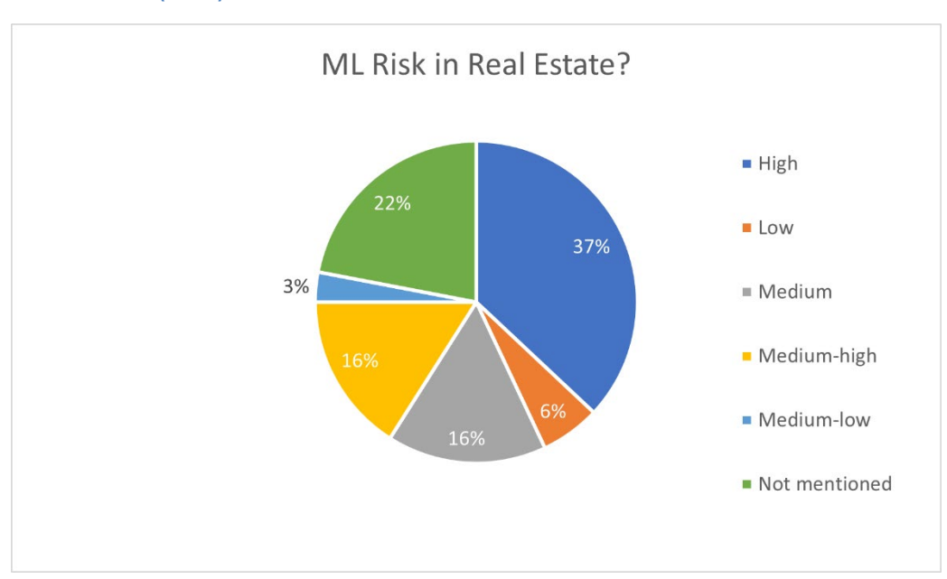
Figure 2.1. Risk assessment of money laundering/terrorism financing via the real estate sector in 32 FATF countries (2022)

Finally, it should be noted that increased visibility on cross-border transactions in the real estate sector has the potential to benefit not only tax administrations, but also regulatory, anti-money laundering and law enforcement authorities. Data gathered by the FATF indicates that across 32 FATF member countries, 69% identify the real estate sector as posing a significant risk for money laundering activities. <sup>12</sup> FATF has identified that many of the same techniques used in tax fraud (such as complex ownership structures to hide identities, as well as false or no declarations of relevant assets) are also used to launder funds. Hence, by applying a whole-of-government approach, information collected by tax authorities could be used to combat other types of cross-border financial crimes in the real estate sector.