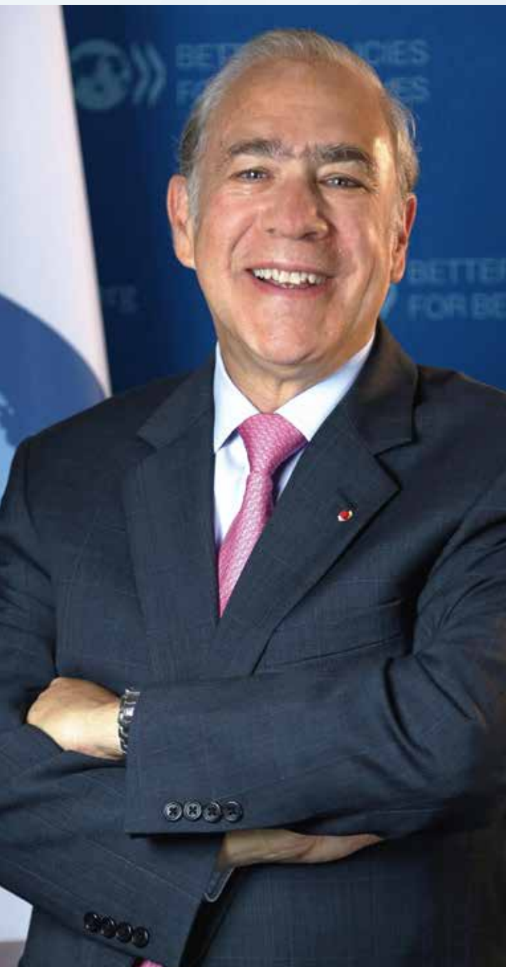
ANGEL GURRÍA – Secretary-General