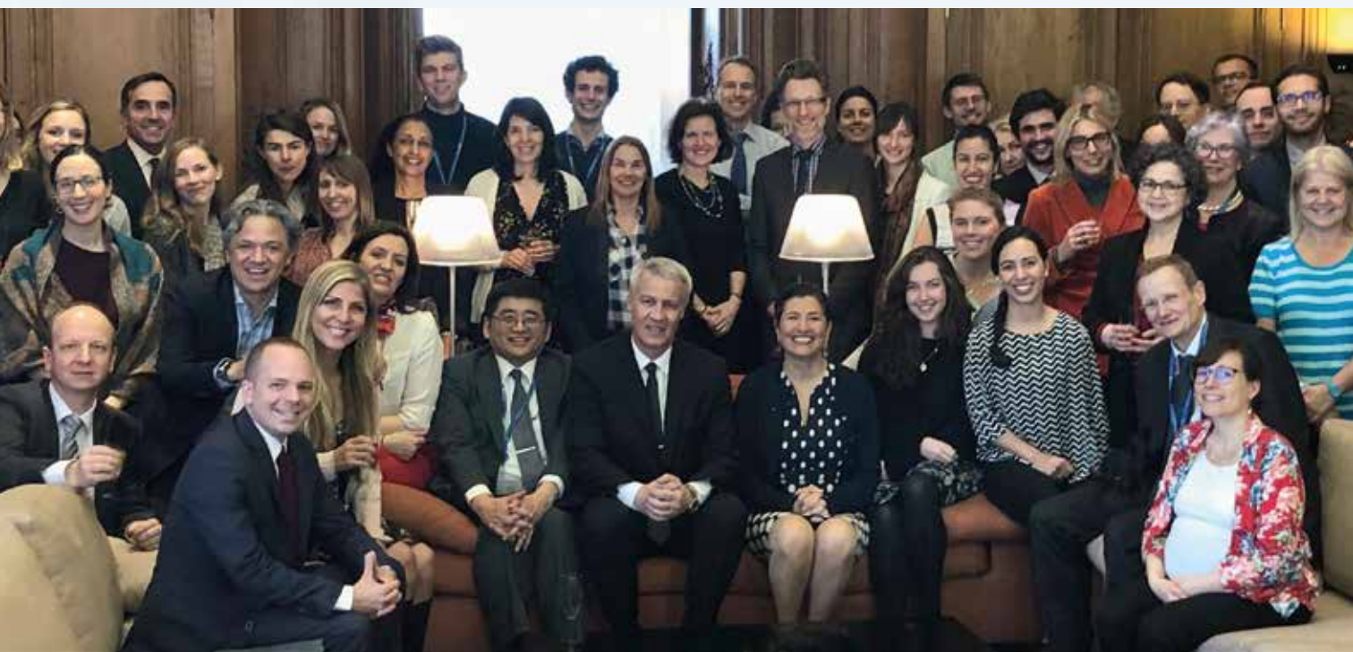
Office of the Secretary-General, OECD, Paris, 4 April 2019.