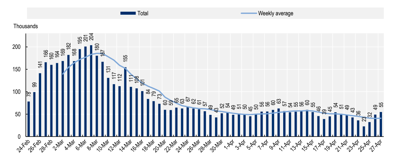
Figure 1. Daily inflows of refugees from Ukraine to neighbouring countries

Daily outflows from Ukraine increased rapidly in the first days of the conflict, peaking at over 200 000 on 6 March 2022, and have declined progressively since then. As illustrated in Figure 1, according to UNHCR data daily outflows from Ukraine have stabilised at around 50 000 before declining further in recent days.